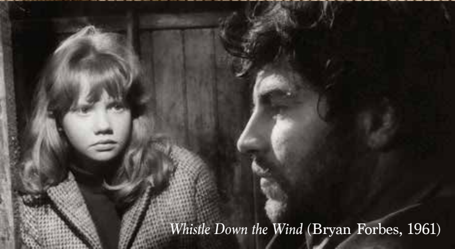
Whistle Down the Wind (Bryan Forbes, 1961)