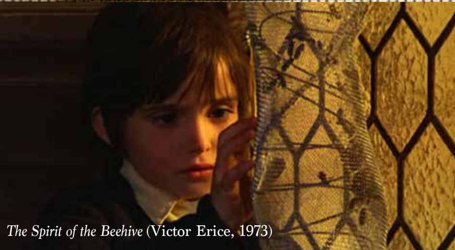
The Spirit of the Beehive (Victor Erice, 1973)