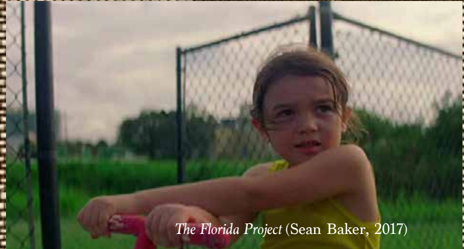
The Florida Project (Sean Baker, 2017)